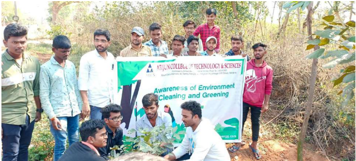
Awarness of environment cleaning and greening at our college campus

E-mail: principalacts@gmail.com , website: https://www.arjunengg.com