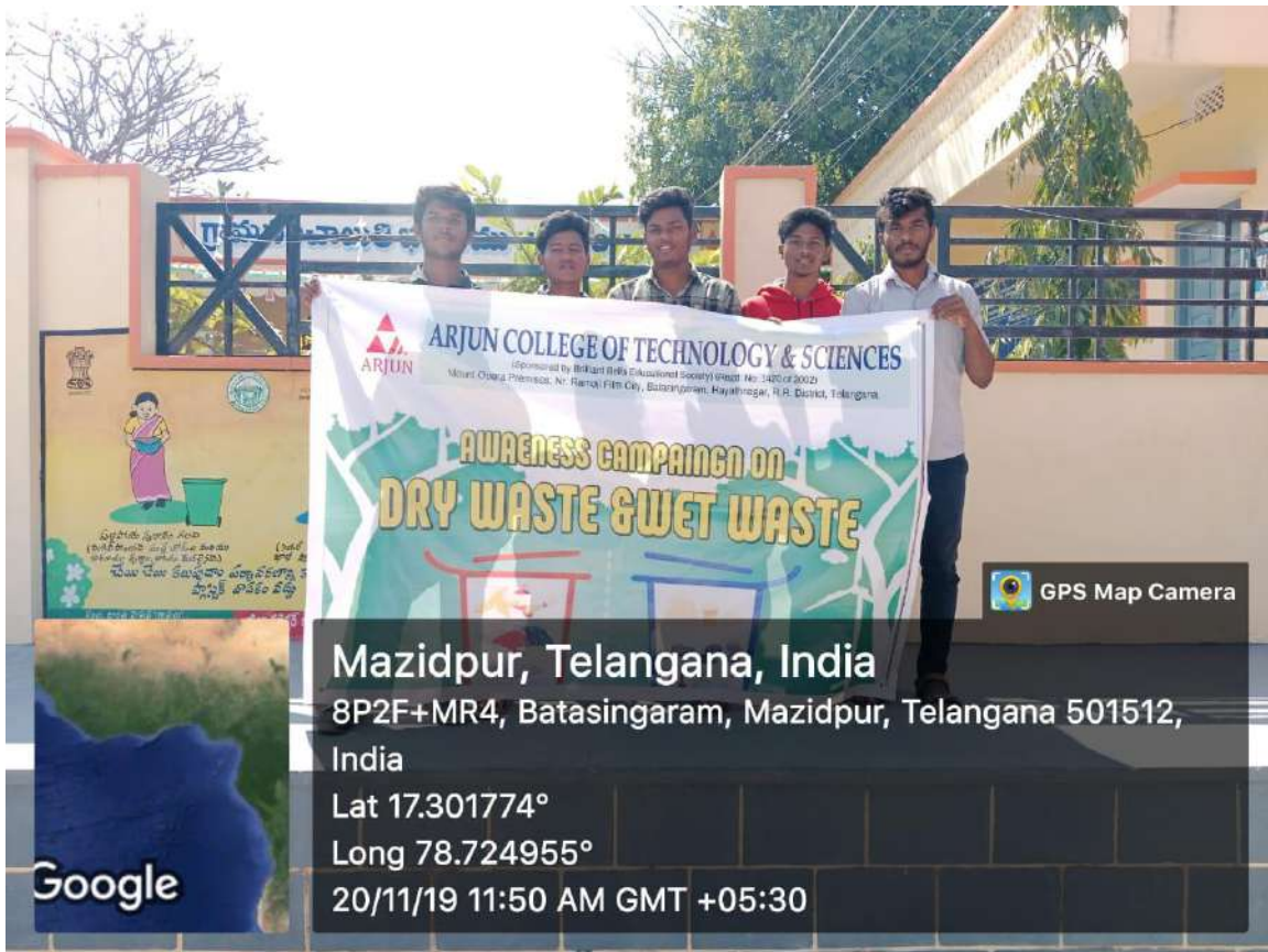
Awarness Campaign on Dry waste & Wet waste

E-mail: principalacts@gmail.com , website: https://www.arjunengg.com