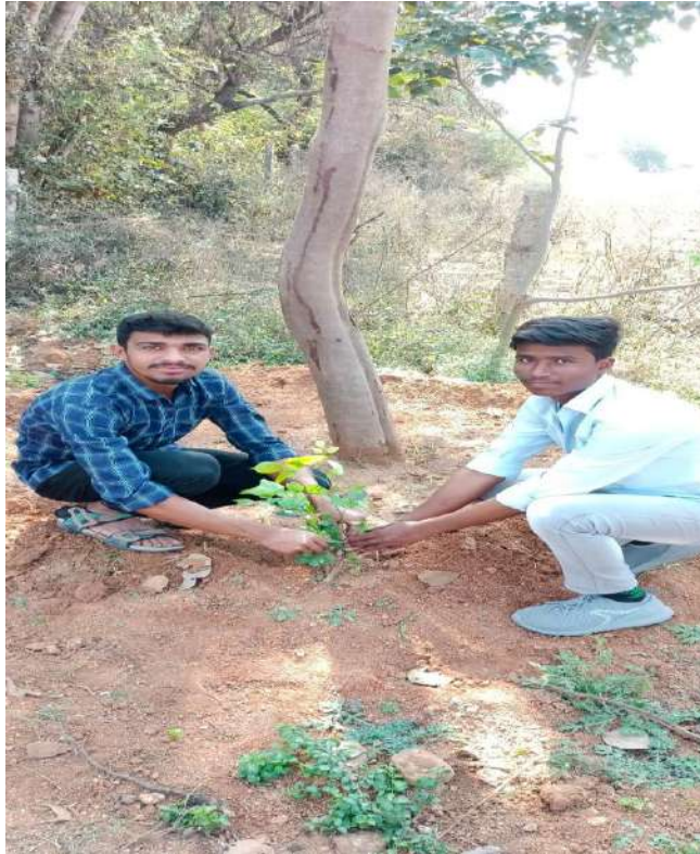
Haritha Haram programme conducted at the campus

E-mail: principalacts@gmail.com , website: https://www.arjunengg.com