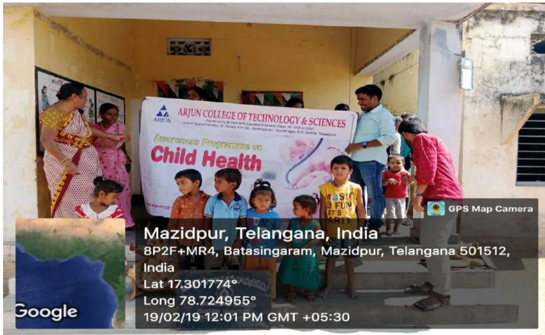
Awarans program on Child Health

E-mail: principalacts@gmail.com , website: https://www.arjunengg.com